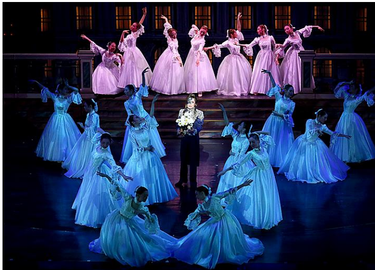
Figure 5: Snow troupe performing Phantom (2018)

The Snow troupe was inaugurated in 1924, the year the Takarazuka Grand Theater opened. It was the first to perform Elisabeth , but has also done many Japanese works, as exemplified by the success of The Treasury of Loyal Retainers , Jin and Ichimuanfuryuki Maeda Kenji . It is considered the upholder of traditional dance and opera for the whole company, being the vanguard of traditional Japanese drama in company that tends towards Western material. 34