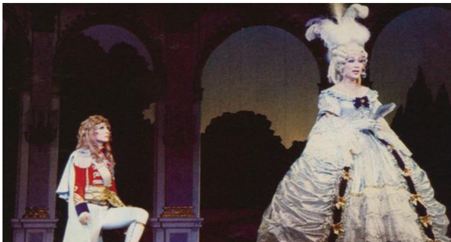
Figure 2: 1974: First performance of Berusaiyu no Bara

Despite the positive effects of the economic growth that occurred in Japan at the beginning of the 1970s, Takarazuka's audiences once again began to dwindle. Takarazuka recovered from this in 1974 with the staging of Berusaiyu no Bara , the romance story set at the court of Marie Antoinette. The stage show was based on the best-selling Japanese manga of the same name by Ikeda Riyoko and it featured Oscar, a girl raised as a boy from birth in order to continue the patrilineal post of general in the Queen's guard. Berusaiyu no Bara was responsible for the dramatic increase in popularity for the company and established the top star system that is still the current model of performer hierarchy in the company. The show has come to be synonymous with the company due to its success and for reinforcing Takarazuka's image as a theater of extravagant visual elements and romance. 21