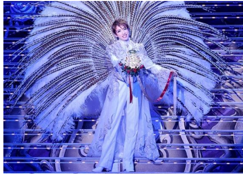
Figure 3: Example of the final costume with ostrich feathers

Considering make-up, kabuki and Takarazuka have much in common as their make-up is as thick as that of geisha and their make-up is applied by the performers themselves. In the recent years, Takarazuka has increasingly pursued a more natural look, but at times the bright red lips and purple or blue eye shadow may evoke an image of kabuki. Furthermore, it can be said that the make-up resembles nō masks as a certain type of make-up represents a different type of character. 31