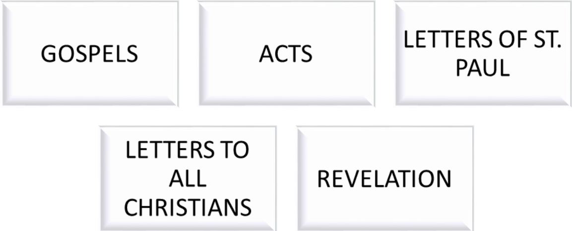
Chart 2. Catholic division of the New Testament

The New Testament is the part of the Bible that tells us about Jesus Christ and his apostles. This part of the Bible is a collection of 27 books divided into five major groups.