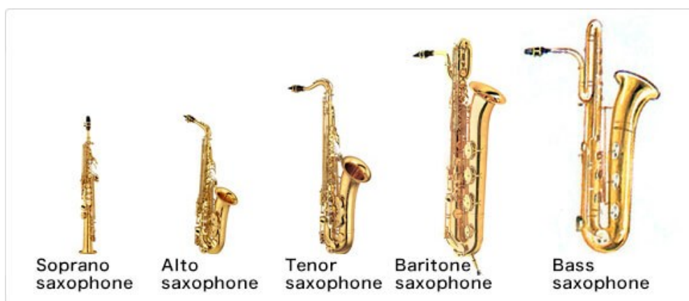
Primjer 1. Usporedba registarskih varijanti saksofona. 1

Kvartet saksofona je sastav koji se sastoji od četiriju saksofona: sopran-saksofona, alt-saksofona, tenor-saksofona i bariton-saksofona. Sva su četiri navedena saksofona transponirajući instrumenti – sopran-saksofon i tenor-saksofon su „in B“, a alt-saksofon i bariton-saksofon su „in Es“. U praksi možemo reći da sopran-saksofon zvuči veliku sekundu niže od zapisanoga, alt-saksofon veliku sekstu niže, tenor-saksofon oktavu i veliku sekundu niže te bariton-saksofon oktavu i veliku sekstu niže od zapisanoga. Budući da je saksofon virtuozni instrument, takav sastav ima mnogobrojne mogućnosti. U mojoj kompoziciji svaki od četiriju saksofona ima samostalnu dionicu, a njihov odnos sačinjava višeglasje.