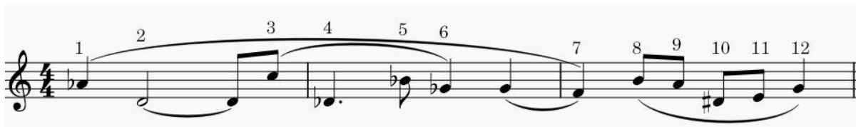
Primjer 20. Tema fuge.

Tema moje fuge skladana je kao dodekafonski niz (prikazan u 2. poglavlju ovoga rada), odnosno po principu da se svaki ton koristi jednom i da redoslijed tonova ne upućuje na harmonijske funkcije ili razložene akorde. Da bi od niza nastala tema, bilo je potrebno zadati ritam i definirati fraze. U drugome taktu možemo primijetiti da se ponavlja ton ges1 (označen brojkom 6), no to je dozvoljen pomak u dodekafoniji.