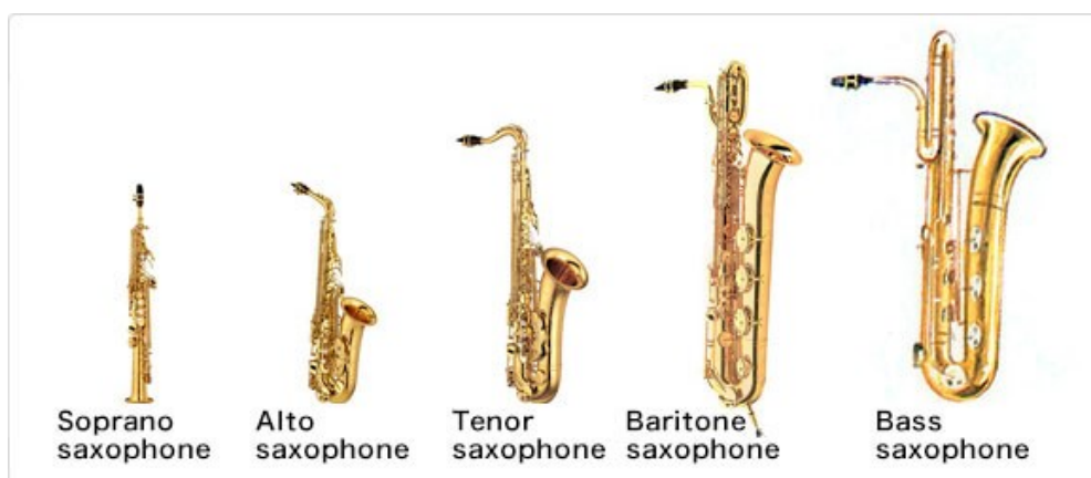
Primjer 1. Usporedba registarskih varijanti saksofona. 1

Kvartet saksofona je sastav koji se sastoji od četiriju saksofona: sopran-saksofona, alt-saksofona, tenor-saksofona i bariton-saksofona. Sva su četiri navedena saksofona transponirajući instrumenti – sopran-saksofon i tenor-saksofon su „in B“, a alt-saksofon i bariton-saksofon su „in Es“. U praksi možemo reći da sopran-saksofon zvuči veliku sekundu niže od zapisanoga, alt-saksofon veliku sekstu niže, tenor-saksofon oktavu i veliku sekundu niže te bariton-saksofon oktavu i veliku sekstu niže od zapisanoga. Budući da je saksofon virtuozni instrument, takav sastav ima mnogobrojne mogućnosti. U mojoj kompoziciji svaki od četiriju saksofona ima samostalnu dionicu, a njihov odnos sačinjava višeglasje.