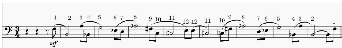
Primjer 7. Tema passacaglie ; niz se kreće od 1 do 12, a zatim retrogradno od 12 do 1.

Tema moje passacaglie sastoji se od dvaju nastupa istoga dodekafonskog niza. Niz najprije nastupa u cijelosti, a zatim se pojavljuje retrogradno. Tema se sastoji od osam taktova i partitura je grupirana u po četiri takta, tako da se jasno može pratiti tijek skladbe.