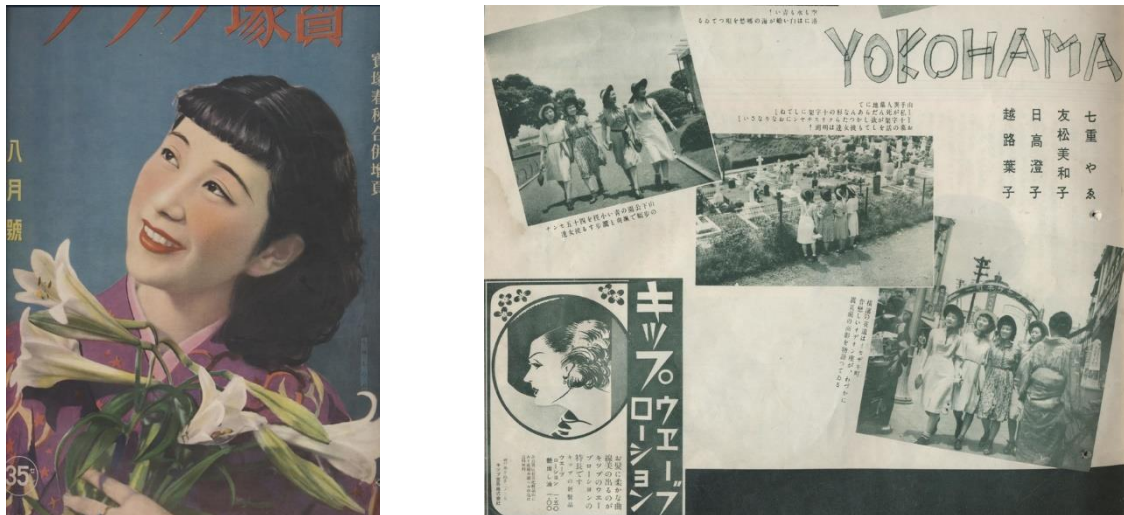
Figure 7: Takarazuka Graph, August 1939

Off stage, the Takarasiennes were showcased outside for public service and commercial activities. Women started practicing new kinds of sports like cycling, tennis, swimming, golfing and Takarasiennes were often photographed playing these kinds of sports which motivated readers to practice themselves. 48