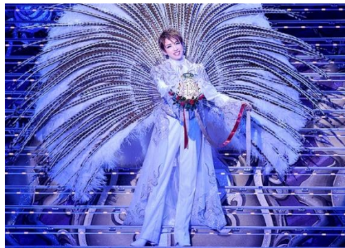
Figure 3: Example of the final costume with ostrich feathers

Considering make-up, kabuki and Takarazuka have much in common as their make-up is as thick as that of geisha and their make-up is applied by the performers themselves. In the recent years, Takarazuka has increasingly pursued a more natural look, but at times the bright red lips and purple or blue eye shadow may evoke an image of kabuki. Furthermore, it can be said that the make-up resembles nō masks as a certain type of make-up represents a different type of character. 31