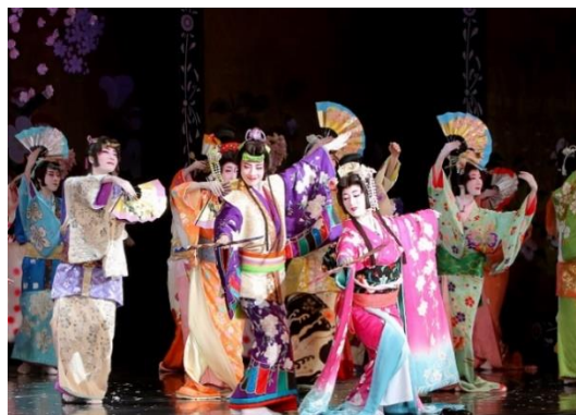
Figure 4: Flower troupe performing Sekkasho (2016)

One of the two original troupes, it began performing in 1921. They are considered the “treasure chest” of otokoyaku . Their performances tend to have larger budgets, with lavish stage and costume designs, and are often derived from operatic material. 32