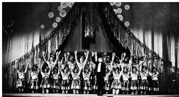
Figure 1: 1927: Performance of Mon Paris

In conclusion Takarazuka was intended to be a means for girls who wanted to perform to do so without damaging their chances of getting married or tarnishing the reputation of their families. Takarazuka was thus exemplary in its early years because it gave women financial independence at a time where women were expected to be financially dependent on men. It is also important to note that irrespective of Kobayashi's original intentions, Takarazuka created an alternative to the traditional path of marrying early and having children. 8