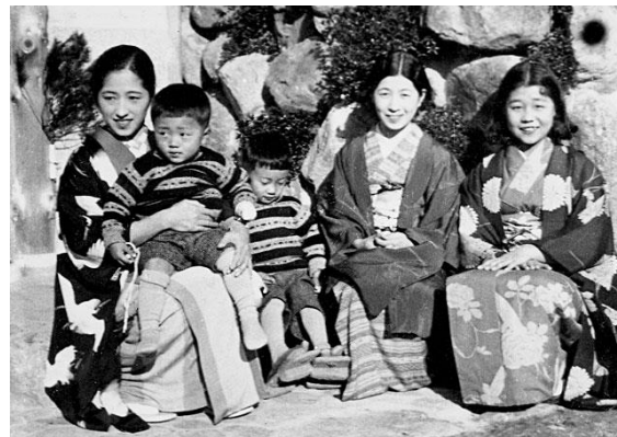
Figure 8: Tezuka Osamu and his brother with Takarasiennes

What characterizes shōjo manga is the art style: flowing hair, sparkling eyes, slender limbs, frilly dresses, but also a strong female lead character and romantic relationships. 69 When discussing the origins of shōjo manga, it's important to mention the professional manga writer, Tezuka Osamu. He is not only considered to be the father of the popular graphic narrative but also respected as the founder of shōjo manga. Alongside that it's likewise important to recognize the direct influence that