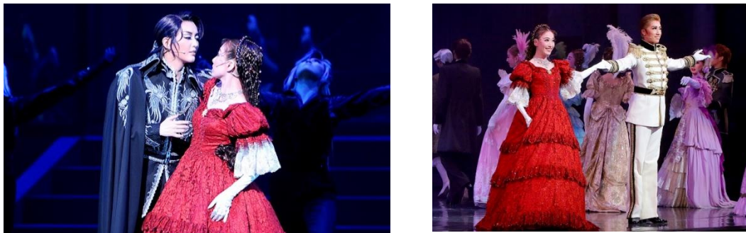
Figure 6: Cosmos troupe performing Elisabeth: Rondo of Love and Death (2016)

The Senka belong to no one troupe. They are a group of specialists who appear in any of the troupes' productions as needed. They add a new twist when they join a performance and help to instruct their junior Takarasienne. 38