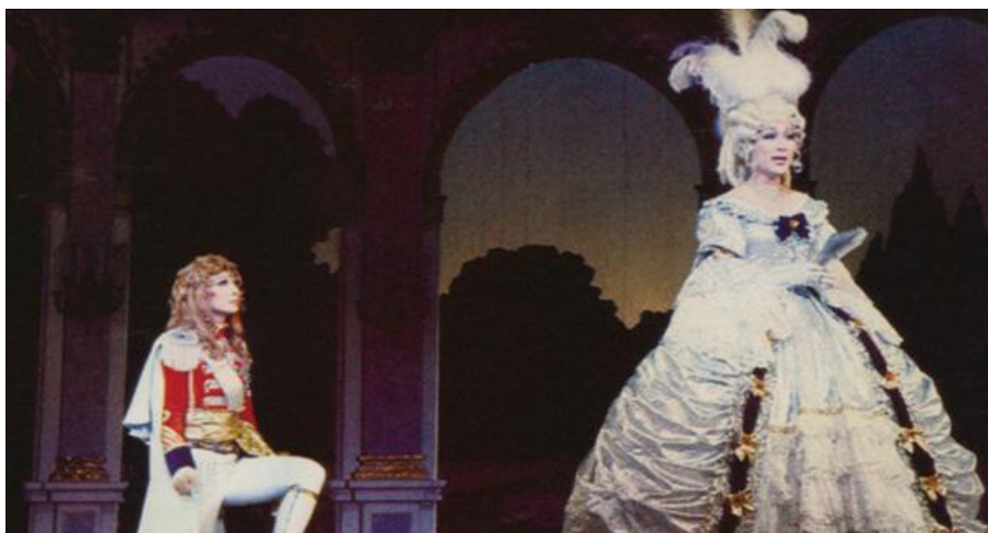
Figure 2: 1974: First performance of Berusaiyu no Bara

Despite the positive effects of the economic growth that occurred in Japan at the beginning of the 1970s, Takarazuka's audiences once again began to dwindle. Takarazuka recovered from this in 1974 with the staging of Berusaiyu no Bara , the romance story set at the court of Marie Antoinette. The stage show was based on the best-selling Japanese manga of the same name by Ikeda Riyoko and it featured Oscar, a girl raised as a boy from birth in order to continue the patrilineal post of general in the Queen's guard. Berusaiyu no Bara was responsible for the dramatic increase in popularity for the company and established the top star system that is still the current model of performer hierarchy in the company. The show has come to be synonymous with the company due to its success and for reinforcing Takarazuka's image as a theater of extravagant visual elements and romance. 21