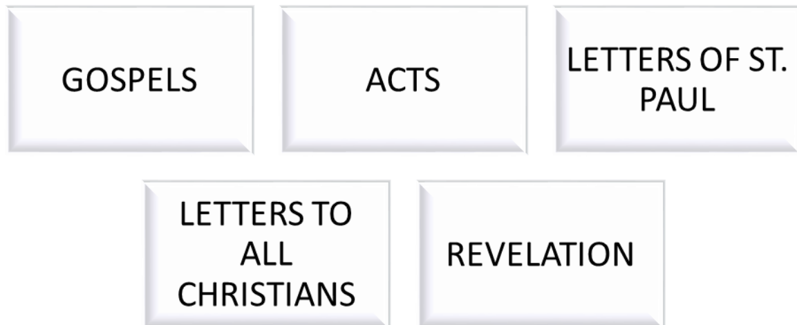
Chart 2. Catholic division of the New Testament

The New Testament is the part of the Bible that tells us about Jesus Christ and his apostles. This part of the Bible is a collection of 27 books divided into five major groups.