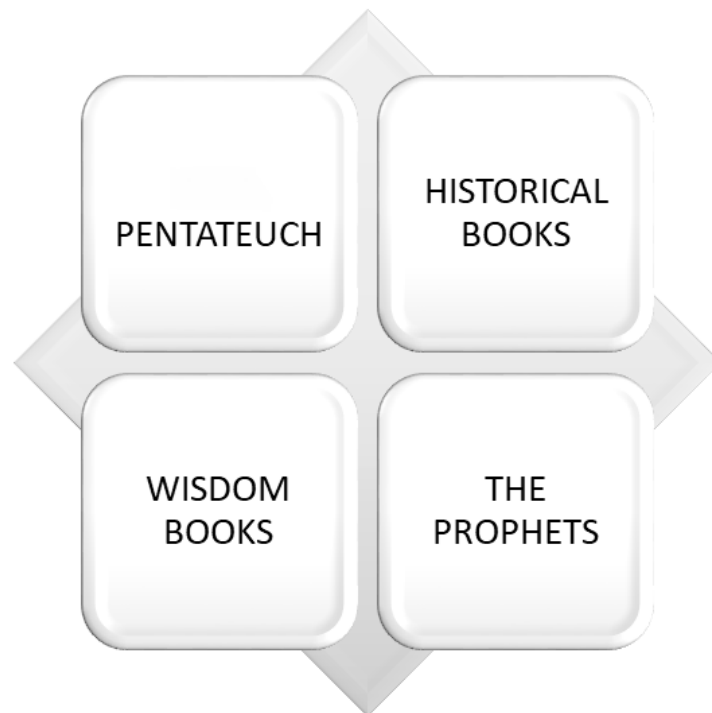
Chart 1. Catholic division of the Old Testament

The Old Testament is the first part of the Bible. This part is a collection of books about the history of the chosen people from the beginning of the world to Jesus' birth. The Catholic version of the Old Testament consists of 46 books written from the thirteenth to the first century BC. These 46 books are divided into four big groups shown in the chart below.