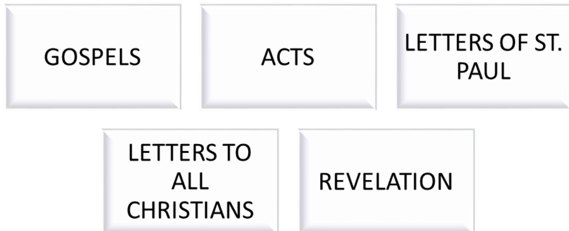
Chart 2. Catholic division of the New Testament

The New Testament is the part of the Bible that tells us about Jesus Christ and his apostles. This part of the Bible is a collection of 27 books divided into five major groups.